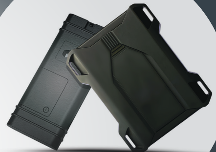
Powered and Self-Powered Asset Trackers